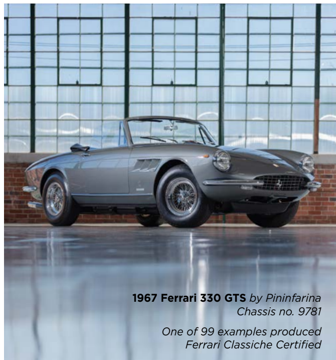
1967 Ferrari 330 GTS by Pininfarina Chassis no. 9781

One of 99 examples produced Ferrari Classiche Certified