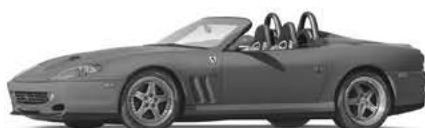
2001 FERRARI 550 BARCHETTA From a Private Ferrari Spider Collection Coachwork by Pininfarina