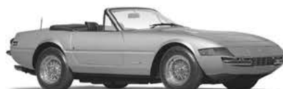
1972 FERRARI 365 GTB/4 DAYTONA SPIDER From a Private Ferrari Spider Collection Formerly the Property of Sydney Pollack Coachwork by Scaglietti | Chassis 14779