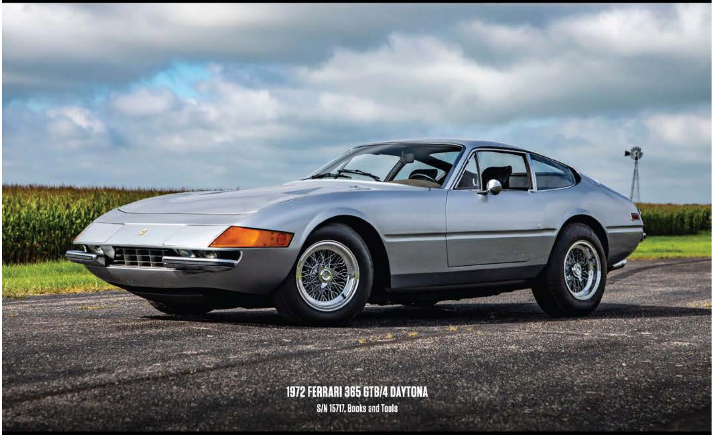
1972 FERRARI 365 GTB/4 DAYTONA S/N 15717, Books and Tools

OSCEOLA HERITAGE PARK - KISSIMMEE, FL • 3,500 VEHICLES JANUARY 2-12, 2020